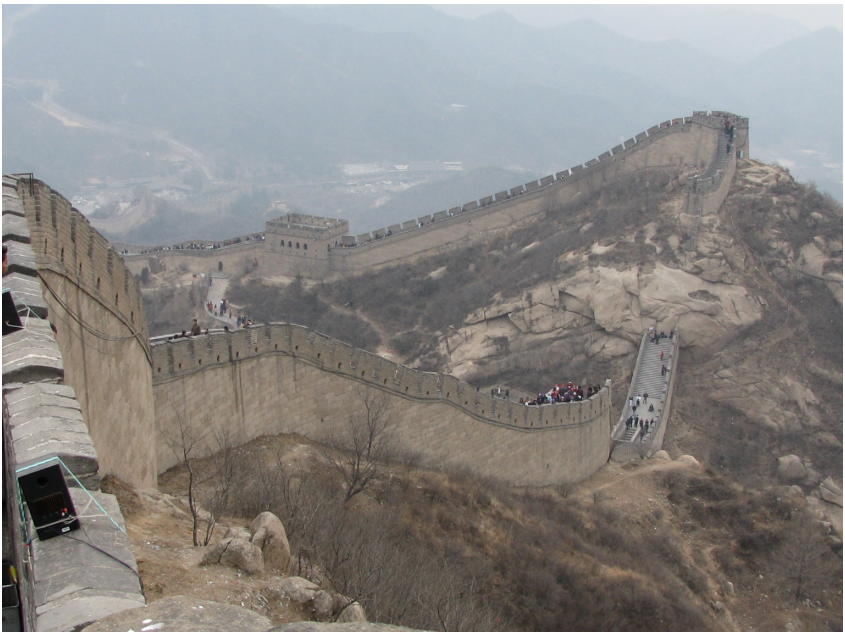
the Great Wall of China, Beijing section