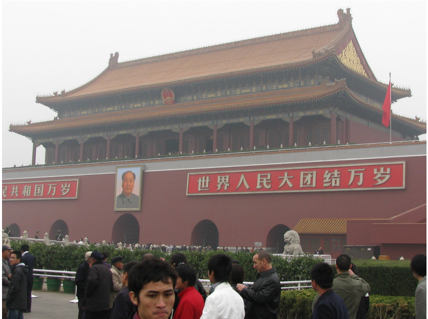
the forbidden city, Beijing